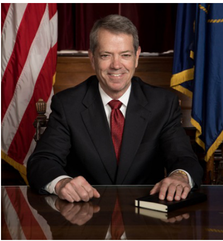
Governor Jim Pillen

More than 40 member stations carry the NBA Governor's Monthly Call In Show, which originates from KLIN in Lincoln. The NBA and Governor Pillen thank our many affiliates and remind you to promote each month's program on the air, online and through social media.