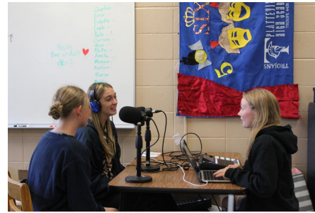
Platteview High students recording content on The Oracle

The High School Radio Project is up and running in year number three. "The Oracle" returned to Platteview High School last month, and another Nebraska high school is preparing to sign on soon. The Project is also active at high schools in Louisiana, Massachusetts and Michigan.