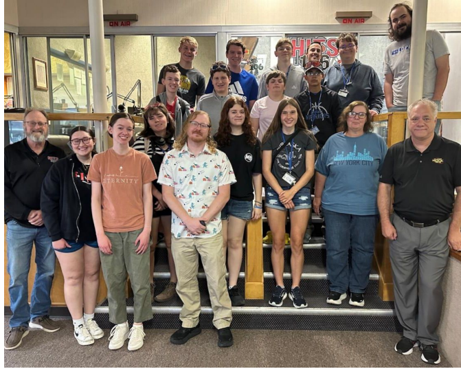
NRG Media Hosts UNK Campers

✓ Supporting Radio & TV broadcast professionals