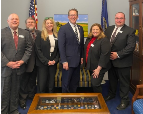
Rep. Adrian Smith with NBA Members