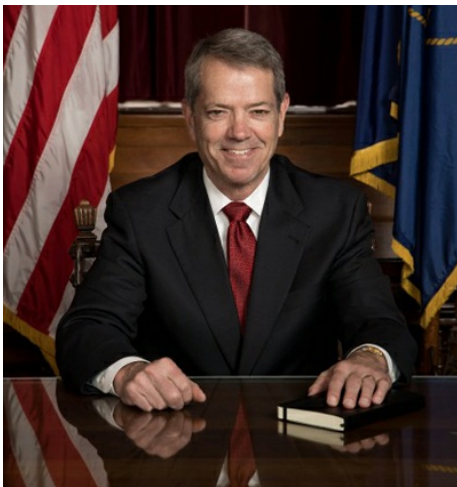
Governor Jim Pillen

All shows air at 2:00 pm CT unless otherwise noted.