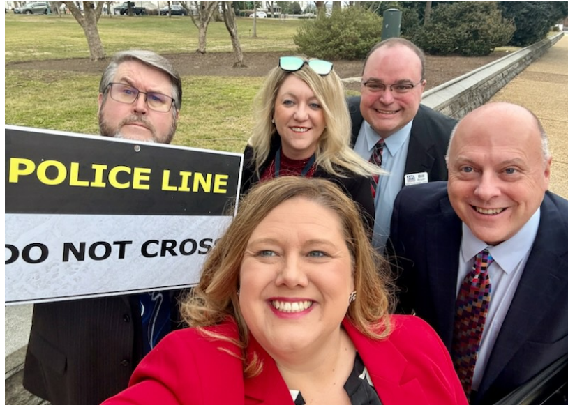
NBA members on Capitol Hill