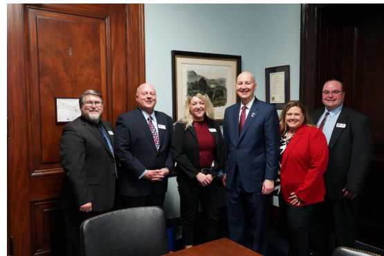
Senator Pete Ricketts with NBA members