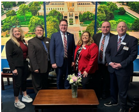
Rep. Mike Flood with NBA Members

Issues discussed in the offices of our federal delegates included the AM For Every Vehicle Act , the Local Radio Freedom Act , ownership caps and protecting the deductibility of advertising as a business expense. The NBA thanks Congressmen Don Bacon, Mike Flood, & Adrian Smith and Senators Deb Fischer & Pete Ricketts for renewing their support of the AM For Every Vehicle Act and the Local Radio Freedom Act.