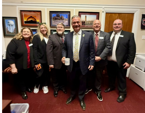
Rep. Don Bacon with NBA members

The NBA will keep you posted on these issues and let you know when we need you to take action.