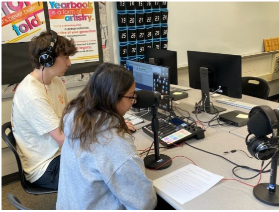
Millard West Students

School. Students are scheduling music, recording newscasts and PSAs and voice tracking using software from PlayoutONE and MusicMaster. The HSRP is also active with schools in Louisiana, Massachusetts and Michigan.