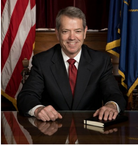
Governor Jim Pillen

All shows air at 2:00 pm CT unless otherwise noted.